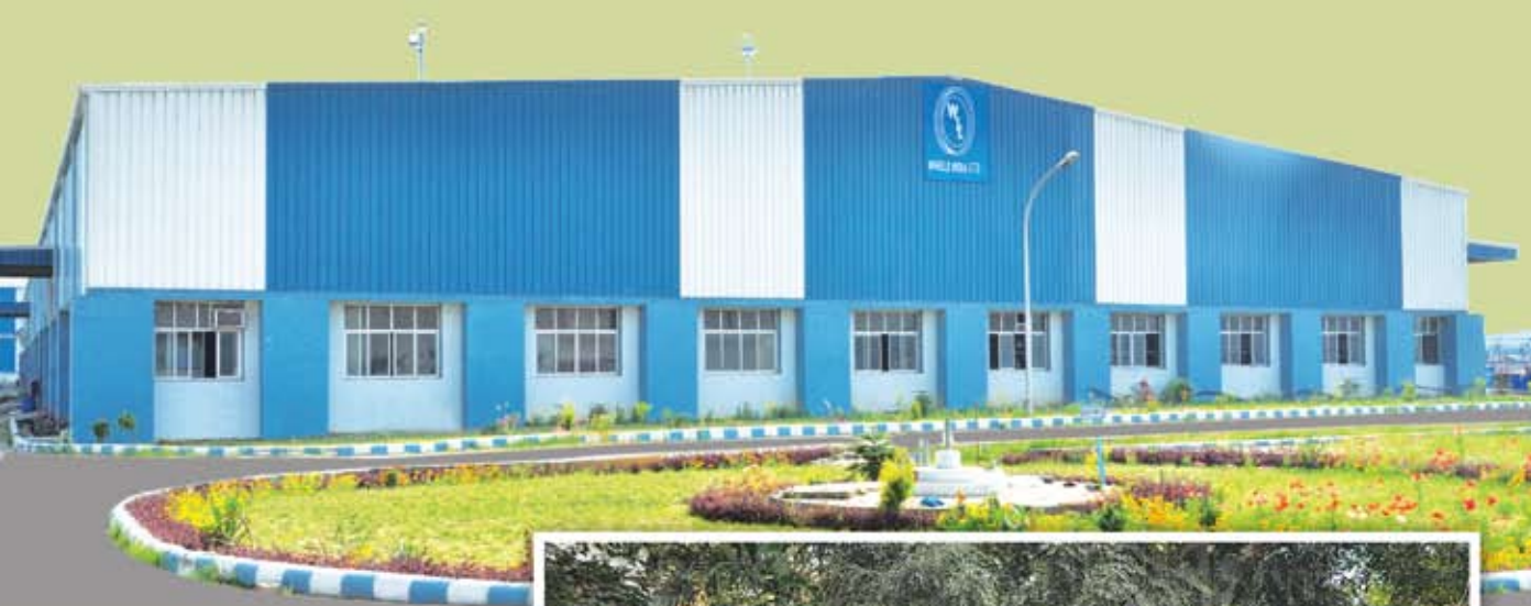
Front view of Pant Nagar Plant