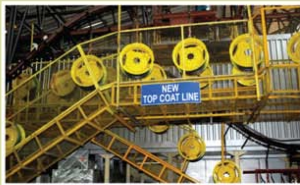
Top Coat Line for Tractor Wheels - Pune