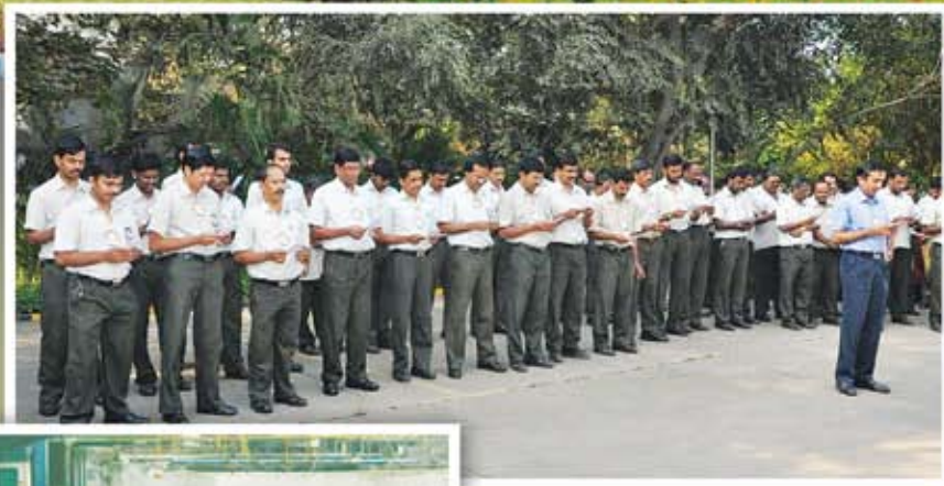
Safety day celebration at Padi Plant