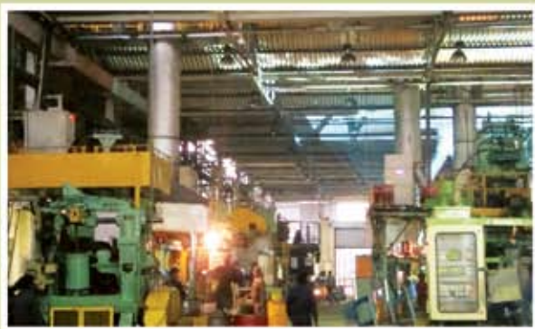
Commercial Vehicle Wheel Line - Rampur