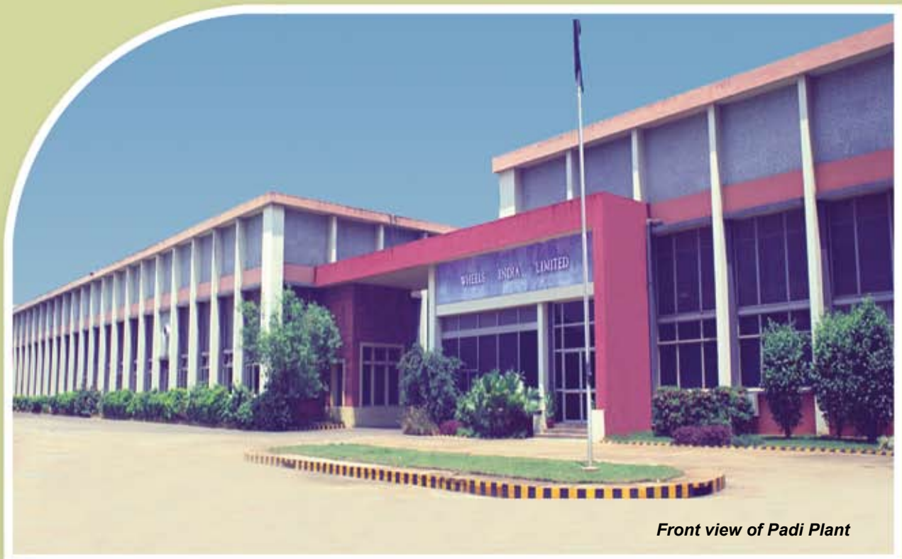
Front view of Padi Plant