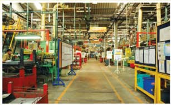
Car Wheel Manufacturing Line - Padi