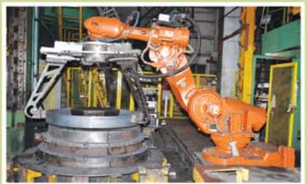
Earth Mover Manufacturing Line - Sriperumbudur