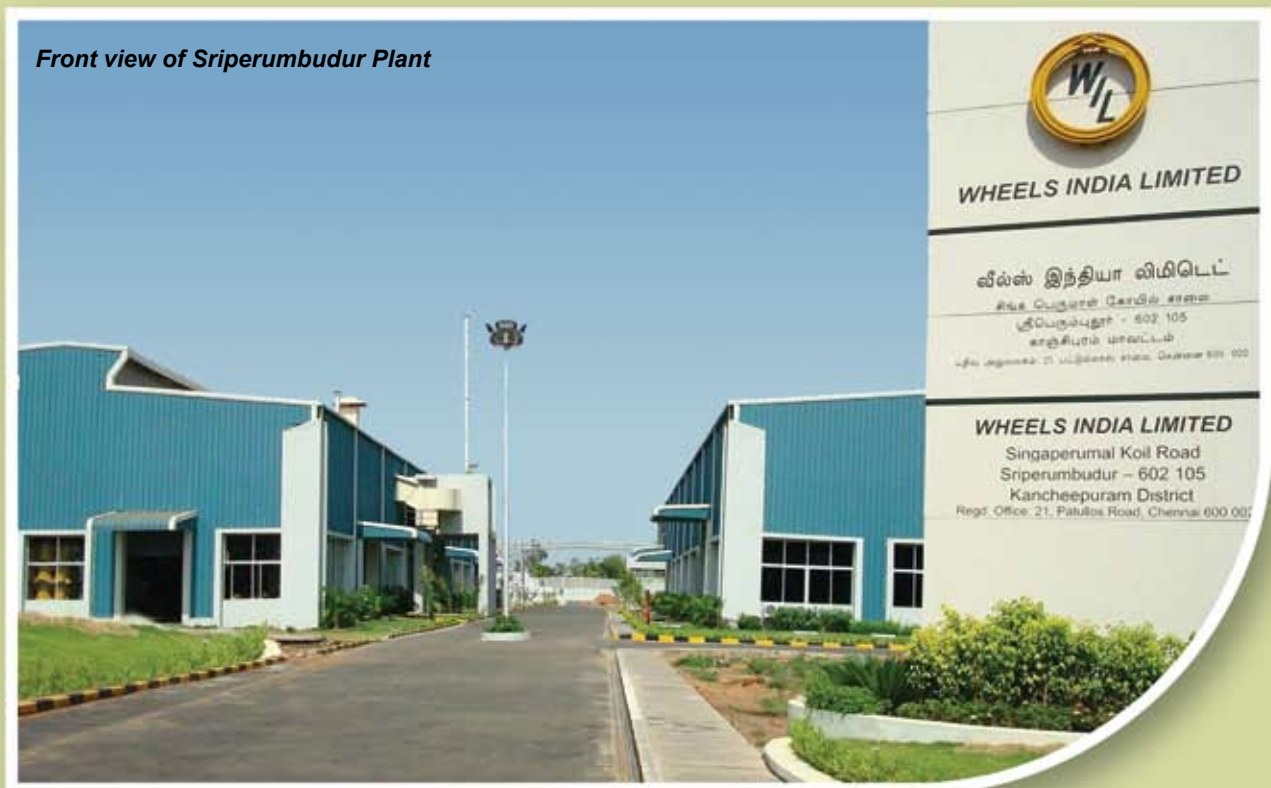
Front view of Sriperumbudur Plant