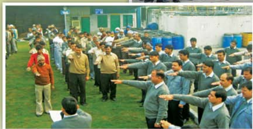
Safety Pledge by Staff at Bawal Plant