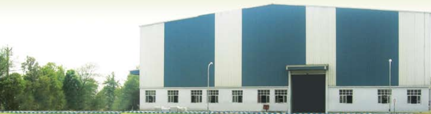
View of Bawal Plant